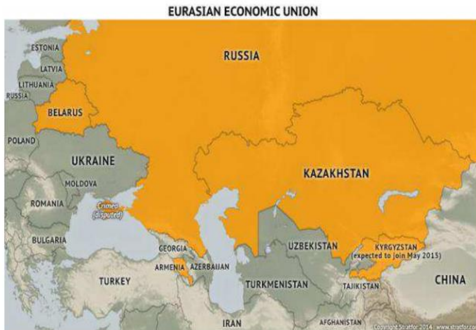
Figure 1 Member states of the EAEU

Therefore, Roszdravnadzor adopted the order No. 1071 dated on 15.02.2017 "On approval of the pharmacovigilance procedure" (registered under No. 46039 by the Ministry of Justice of the RF on 20.03.2017), harmonized with Good pharmacovigilance practices (GVP) and Good clinical practice (GCP) regulations of the Eurasian Economic Union. Pursuant to this order, pharmacovigilance is carried out by the Federal Service for Surveillance in Healthcare (Roszdravnadzor) by means of analysing the information reported by parties to the circulation of medicinal products regarding drug-related side effects, adverse reactions, serious adverse reactions, unexpected adverse reactions, individual intolerance, the lack of drug effectiveness, as well as other facts and circumstances, which are life- or health-threatening when administered to human, revealed at any stage of the circulation of drugs in the Russian Federation and other countries in order to identify possible drug-related adverse effects, individual intolerance, to warn healthcare professionals, patients and to protect them against the use of such drugs [4].